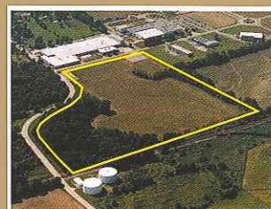
Available 22 acres

An additional 3.5 acres was also sold to Spinball Sports. Spinball will be building a facility to assemble pitching machines. The park has 22 acres remaining for sale.