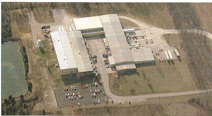
Fortis Plastics, Poplar Bluff, MO

For more information about Fortis Plastics, visit www.fortisplasticsgroup.com ; and for more information on Monomoy Capital Partners, visit www.mcpfunds.com .