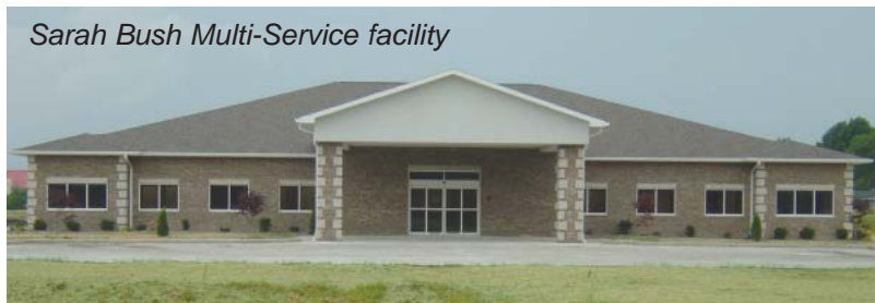
Sarah Bush Multi-Service facility

1977, in Mattoon, Illinois, after residents of Mattoon and Charleston decided to work together to develop a regional hospital. Sarah Bush Lincoln Health System has distinguished