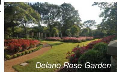
Delano Rose Garden

Decatur. Being located on the Tennessee River is an added bonus for boaters, skiers and fishermen. Festivals throughout the year bring neighbors from around the region together to celebrate. Other amenities include the North Alabama Birding Trail, the Carnegie Visual Arts Center, Princess Theatre Center for the Performing Arts, Riverwalk Marina and the Wheeler Wildlife Refuge.