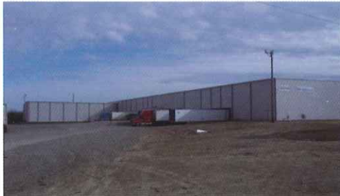
Graham Packaging, Muskogee, OK

In 1996, Agracel purchased an existing 200,000 SF warehousing facility in Vandalia, Illinois, leased by Owens-Brockway. In 2004, Graham Packaging purchased Owens-Brockway, and assumed the long term lease in place on the Vandalia warehouse. In 2010, when the initial lease expired, Graham Packaging entered into a new lease for 80,000 SF of the warehouse, thereby leaving 120,000 SF available for lease.